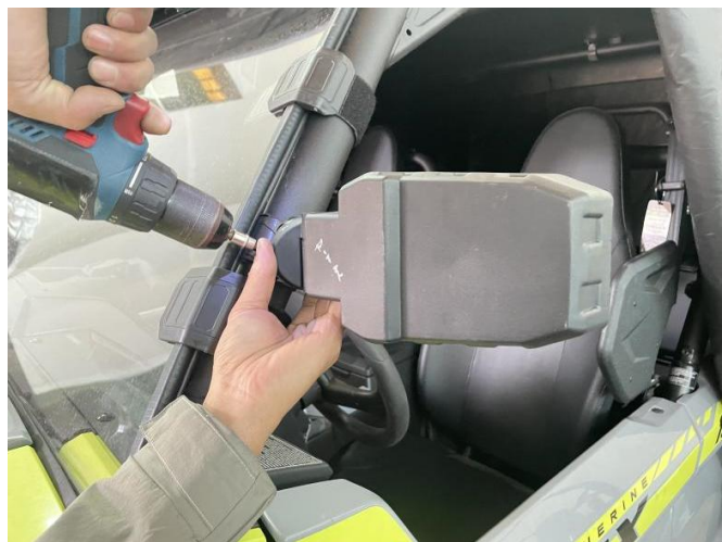
3. Installation finished.