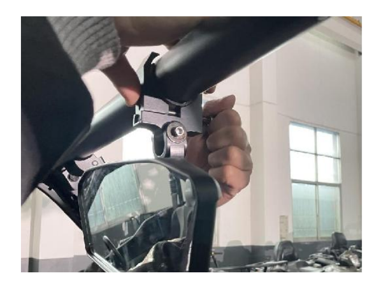
5. Installation is complete.(Note: The lens can be flipped)