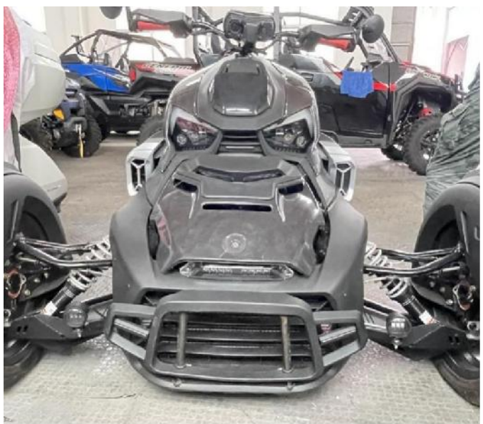
NOTE: Please refer to the installation video in the Amazon listing before your installation, or contact the seller for the installation video.