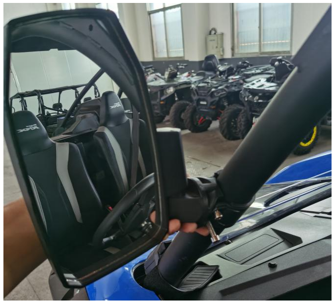
4. Place the clamp on the proper position of