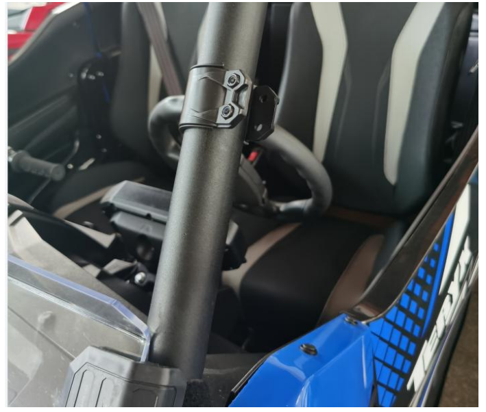
5. Install the mirror on the bracket by M6X45 screws.