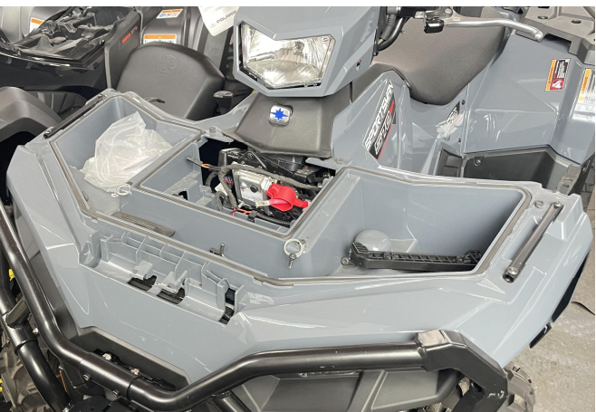
2. Move the storage rack and mounting plate from the original platform to the new platform. As shown in picture: