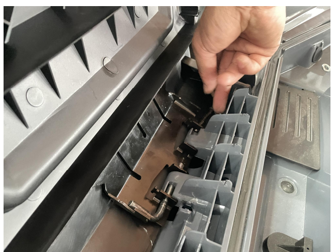
4. Installation finished.