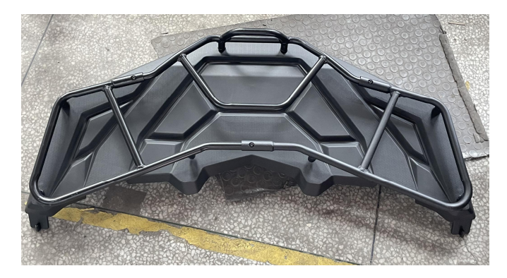
3. Put the new platform back on the vehicle as the step before. Tighten the screws and bolts of limit ropes. As shown in picture: