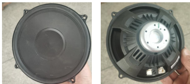
Specified loudspeaker for original vehicle