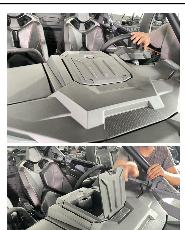
4. Installation finished.