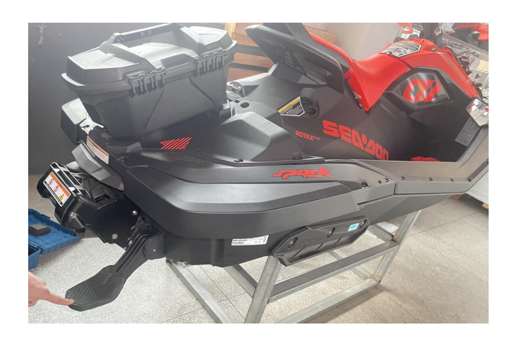
3. Fix the step with screws.