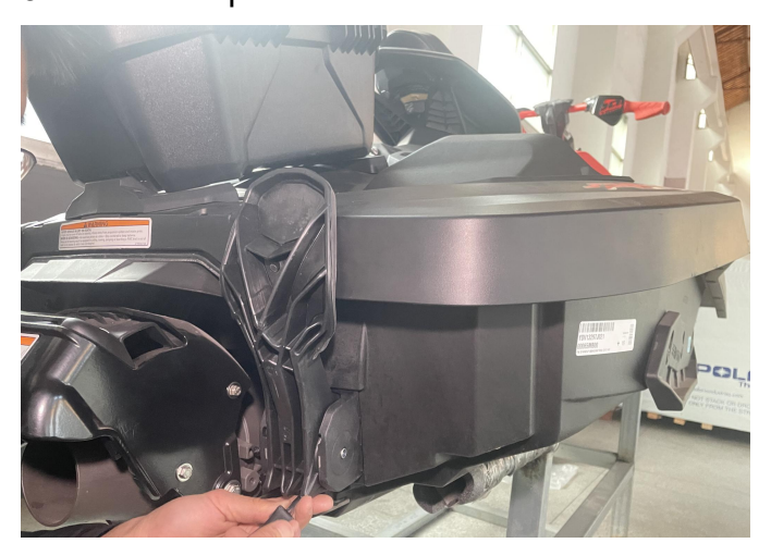
4. The installation is complete.