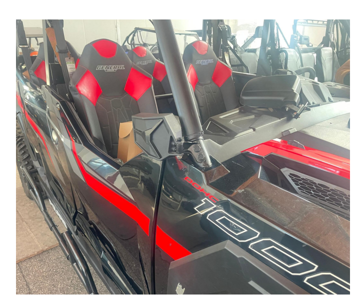
Note: Please refer to the installation video in the Amazon listing before your installation, or contact the seller for the installation video.