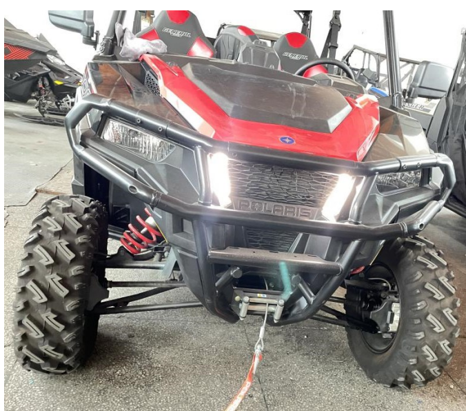
Note: Please refer to the installation video in the Amazon listing before your installation, or contact the seller for the installation video.