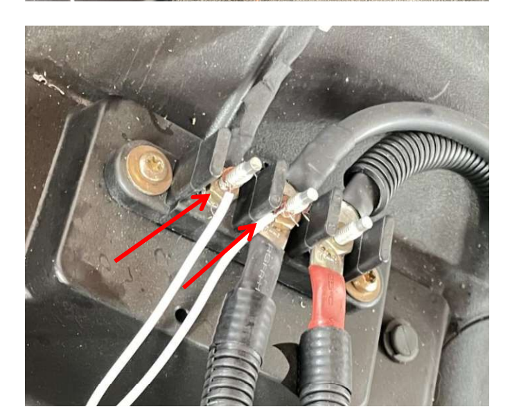
5. Installation finished.