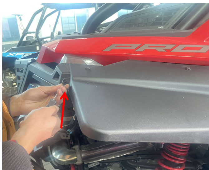
4. Installation completed.