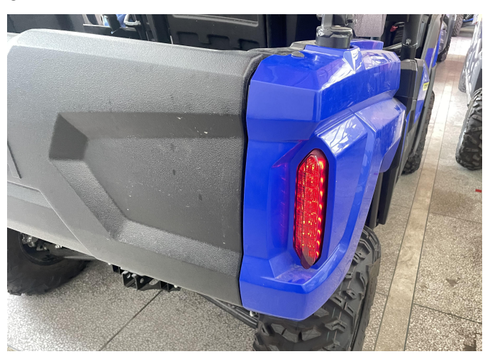
Note: Please refer to the installation video in the Amazon listing before your installation, or contact the seller for the installation video.