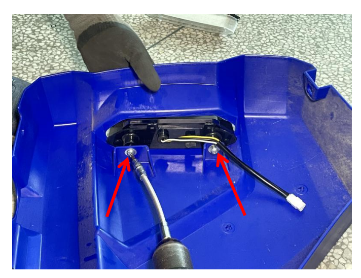
5. Installation finished.