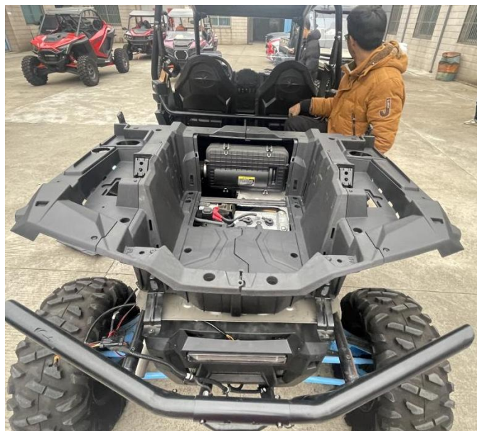
4. Installation complete.

the original vehicle to fix it. The splicing place in the cargo box is directly fixed with the ball head screw of the original vehicle. Finally, the frame and other accessories removed before can be put back in place. As the picture shows: