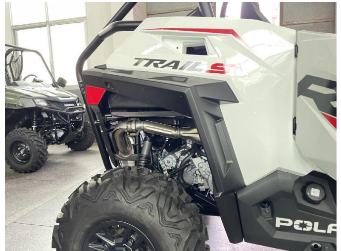
6. Installation complete.