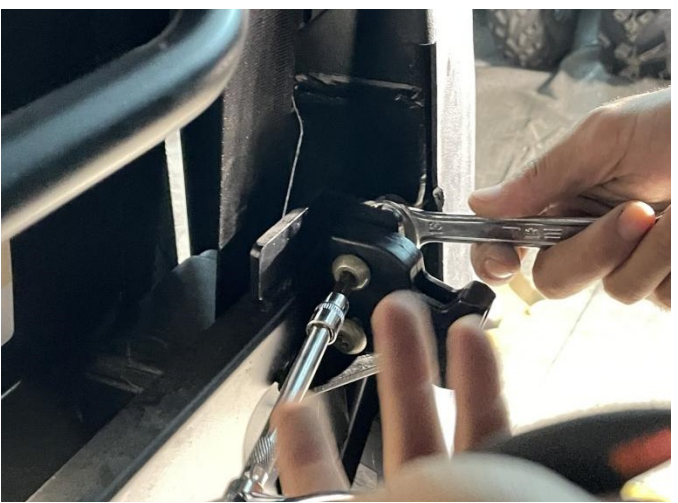
2. Installation finished.