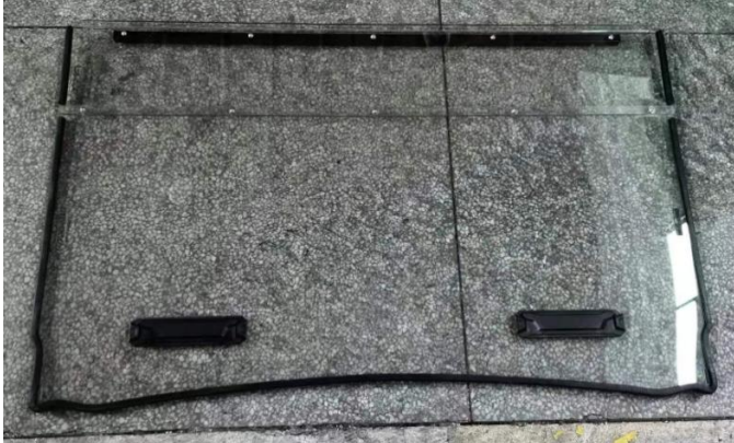
3. Using two small straps to secure the windshield to the lower end of the front roll bar. As the picture shows: