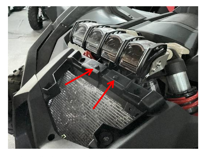
7. Installation completed.