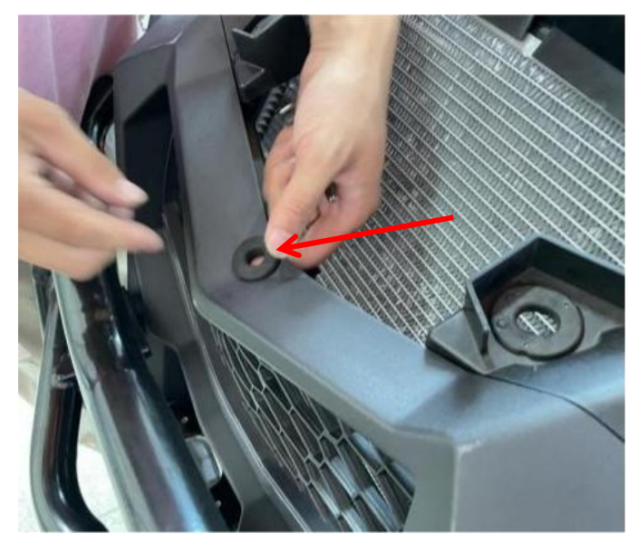
9. Installation completed.