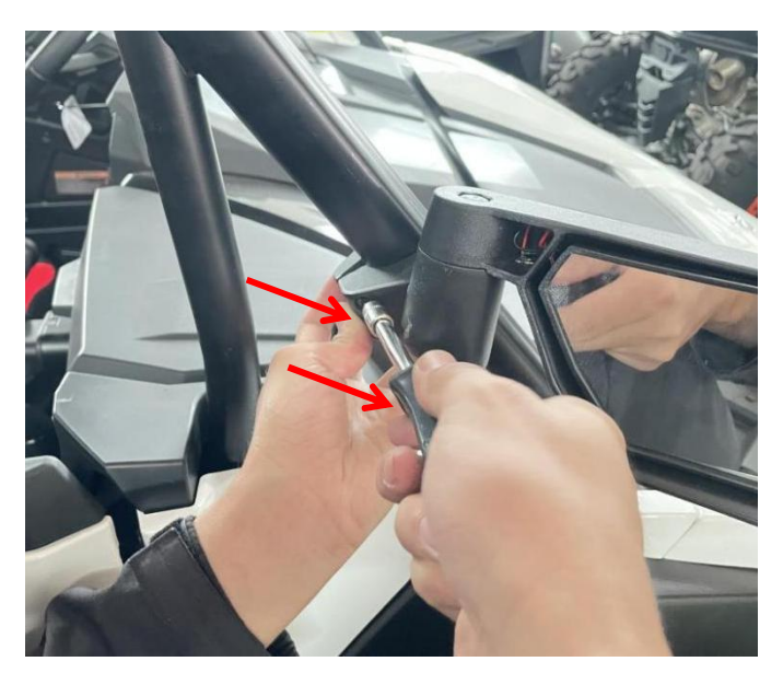
3. Installation finished.