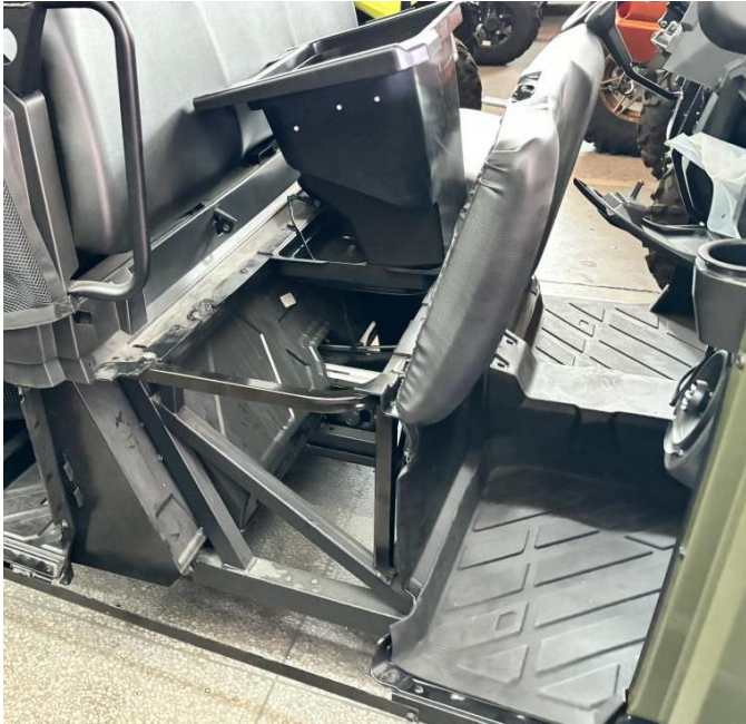
plate need to be stuck on the front guard plate of the original vehicle seat, hold it in place.